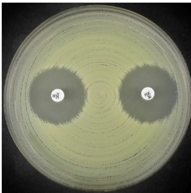
Cefiderocol disc 30 µg